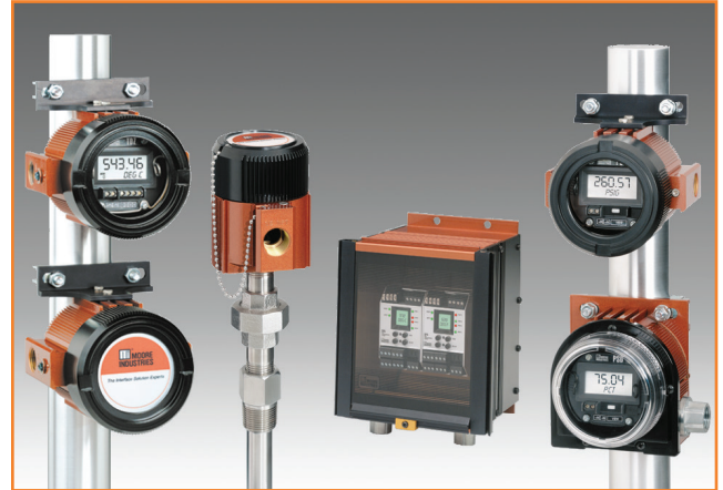
Moore Industries offers a variety of standard enclosures for mounting our, or anyone else's, instruments in the field and the control room.

At a fraction of the cost, the D-BOX provides the right level of protection in areas where explosion-proof certifications are not required. This NEMA 4X, IP66 enclosure accommodates temperature, pressure, level, and flow transmitters, meters, indicators, analyzers, integrators and many other hockey-puck style instruments. The D-BOX meets standards for enclosing indoor and outdoor electronic instruments approved for use in intrinsically-safe and non-incendive areas.